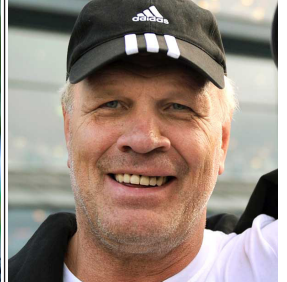
Frank Andersson Wrestling legend